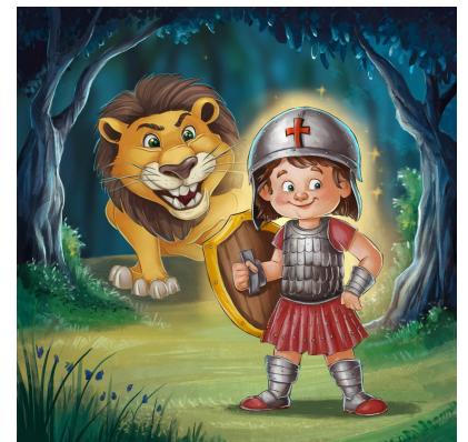
Satan, “The roaring lion” 1 Peter 5:8

Conclusion: Reiterate that while both are called lions, Jesus as the “Lion of Judah” is our protector and leader, and Satan is someone we need to be watchful of, just like the verses say.