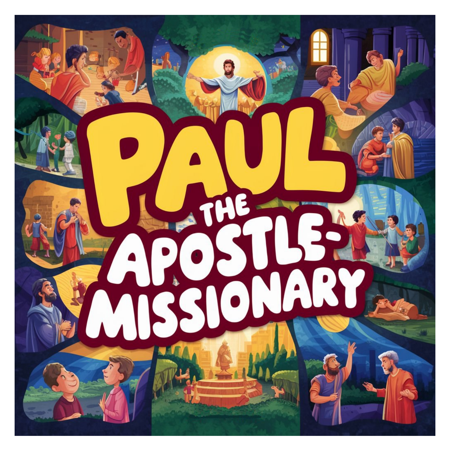
Quarter 2 — Lesson 17