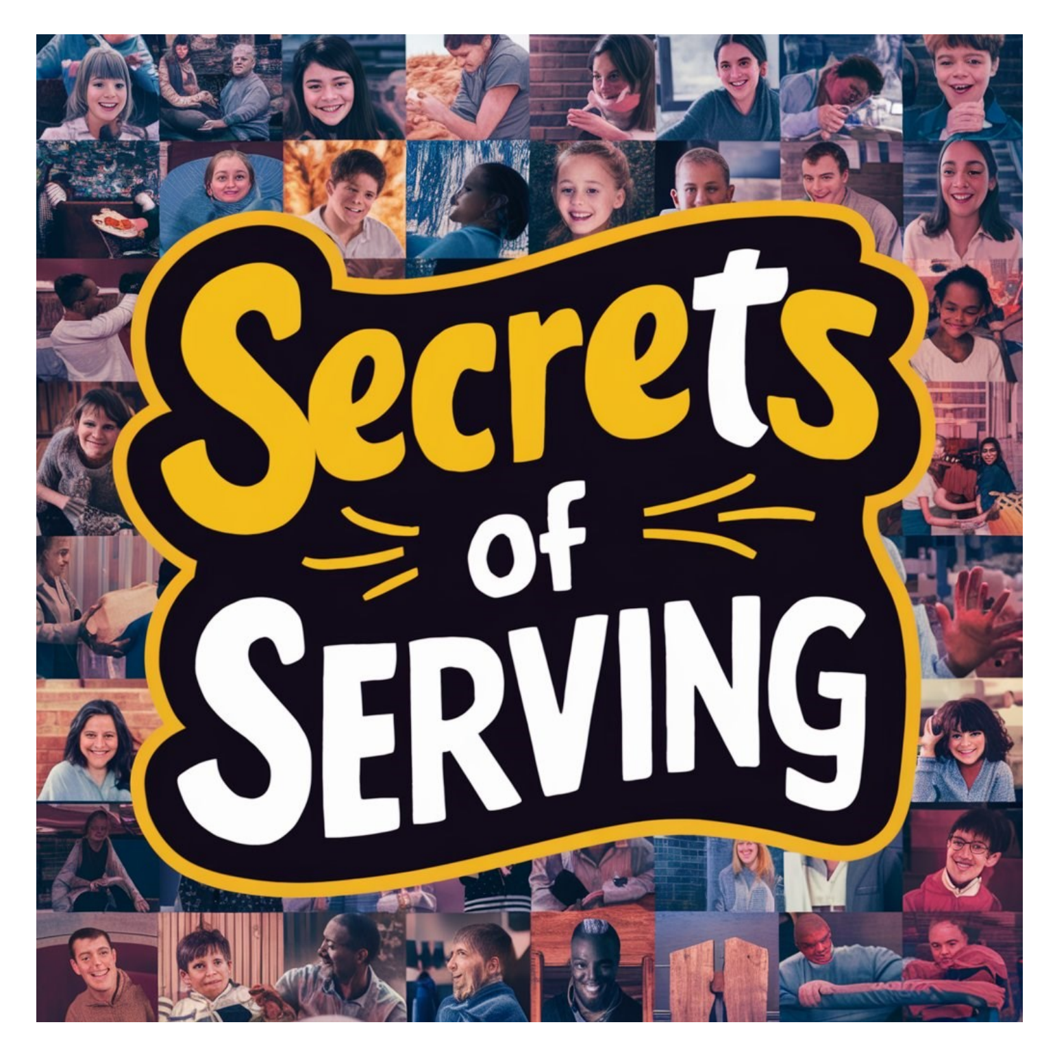
Quarter 2 — Lesson 24