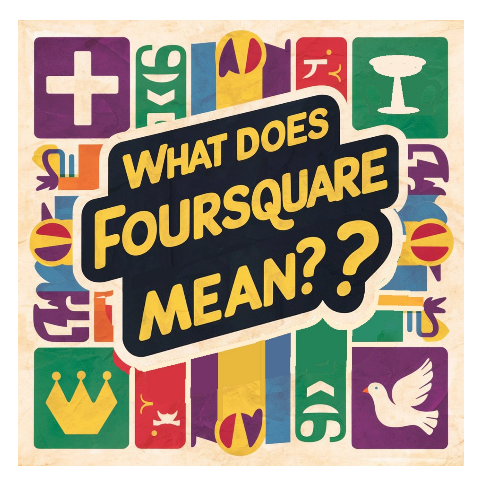
Quarter 2 — Lesson 21