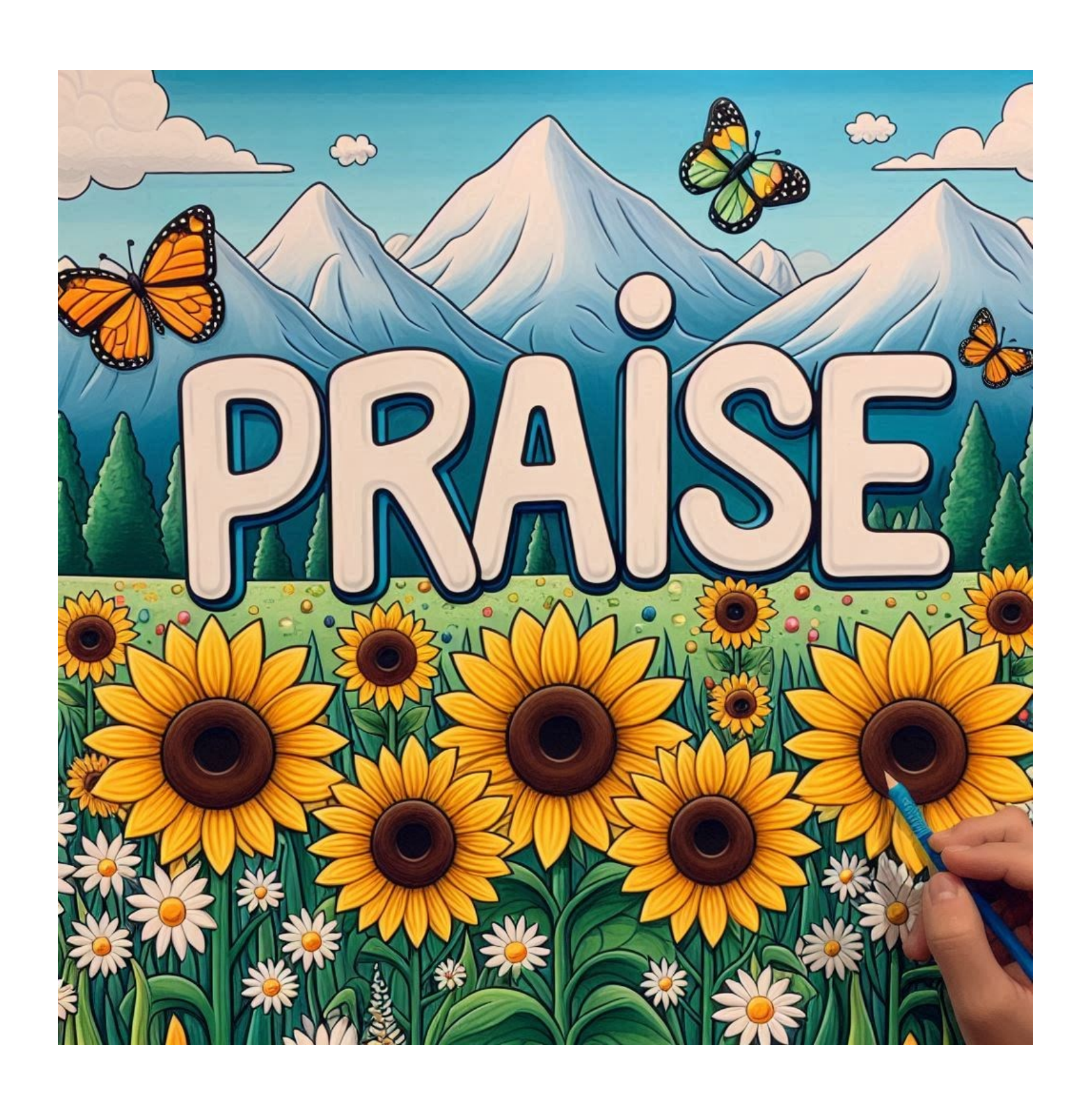
Quarter 3 — Lesson 30